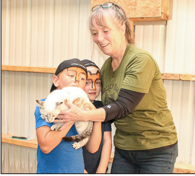
Castoff Pet Rescue made plenty of cuddly critters available on Saturday for the grand opening of its Patton Place facilities.

Folks were welcome to bring their own pets or adopt new furry family members as they explored the grounds and shopped for items from the Castoff Pet Rescue Thrift Store