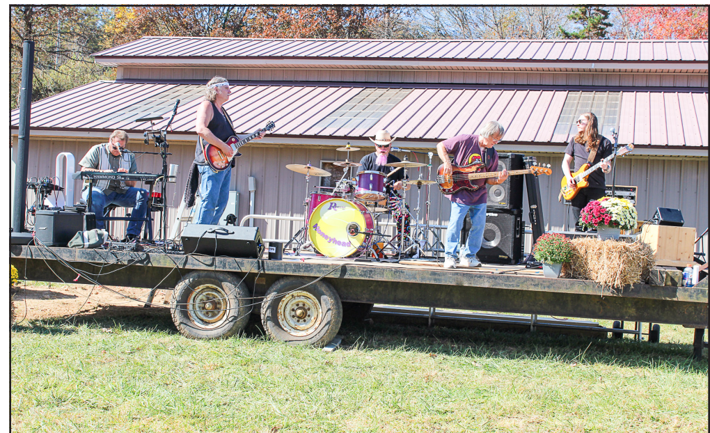
The Cletus Way band performed live for guests of the Castoff Pet Rescue Grand Opening over the weekend.

We named the cat Mama Lacy - that was on July 18. The babies were born on July 24, and they stayed at my house until they got a little age